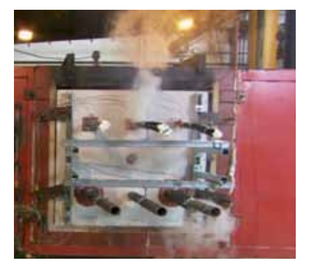
Fire test after seismic impacts