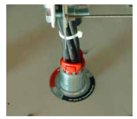
Firestop sleeve test details